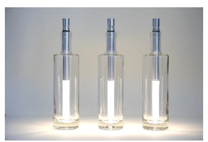
Model BOT04-k: white light