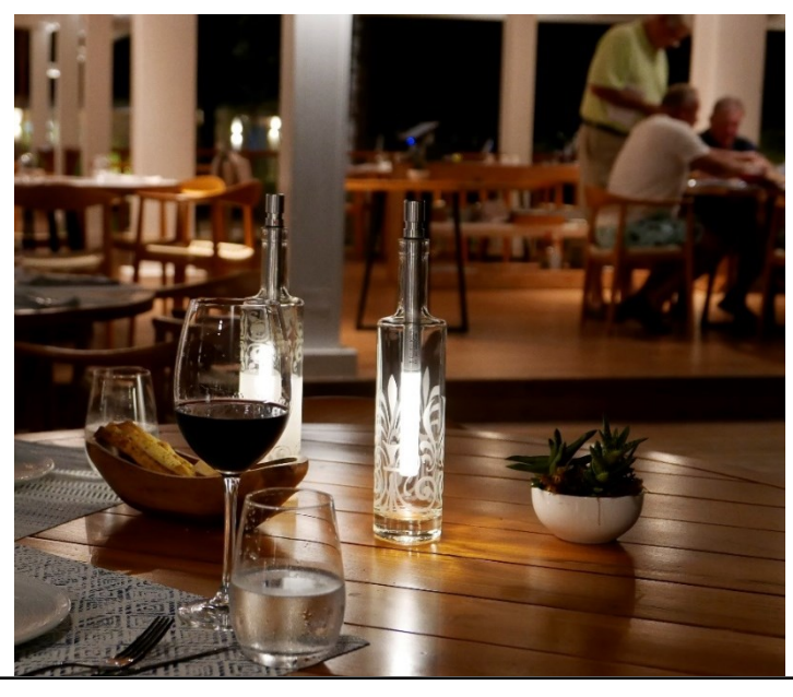
14469 Potsdam / Germany