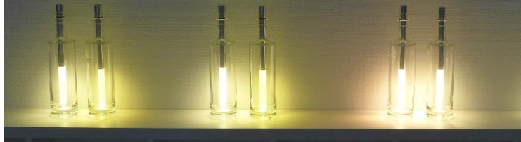
BOT03-k: white (5000 K)