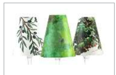
Mod.: WS 584 – Pastel Vineyard