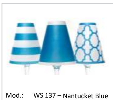
Mod.: WS 137 – Nantucket Blue