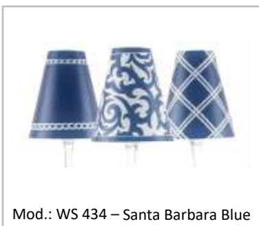
Mod.: WS 434 – Santa Barbara Blue