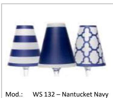
Mod.: WS 132 – Nantucket Navy