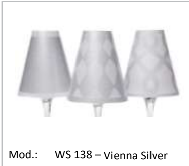
Mod.: WS 138 – Vienna Silver