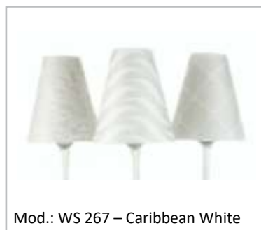
Mod.: WS 267 – Caribbean White