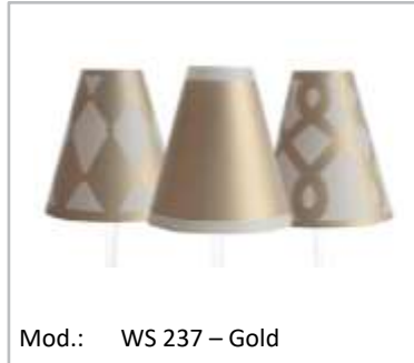
Mod.: WS 237 – Gold