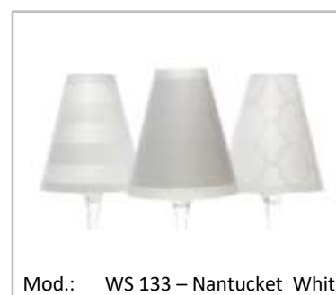
Mod.: WS 133 – Nantucket White