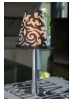
Mod.: BOT09-5 – light color and intensity selectable