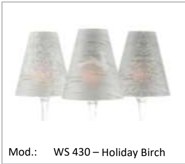
Mod.: WS 430 – Holiday Birch