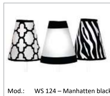
Mod.: WS 124 – Manhattan black