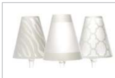
Mod.: WS 125 – Manhattan white