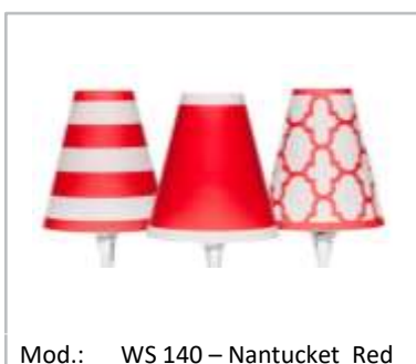
Mod.: WS 140 – Nantucket Red