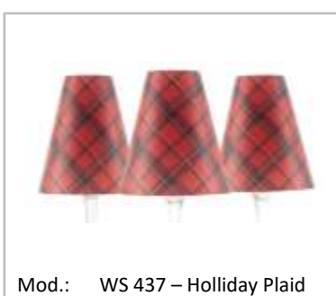
Mod.: WS 437 – Holliday Plaid