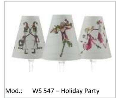
Mod.: WS 547 – Holiday Party