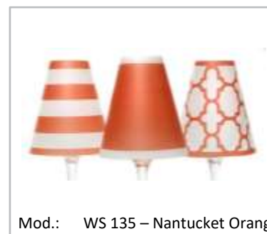
Mod.: WS 135 – Nantucket Orange