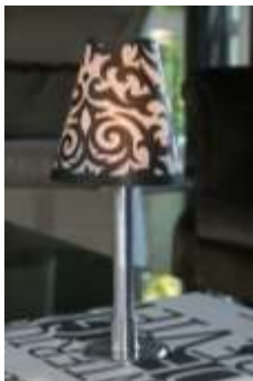
Mod.: BOT09-3 - standard