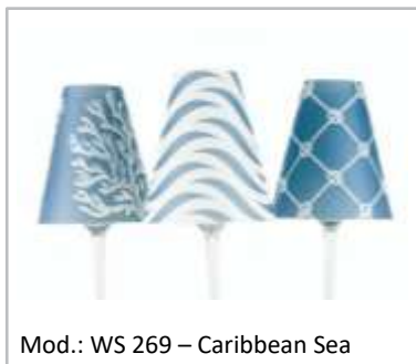
Mod.: WS 269 – Caribbean Sea