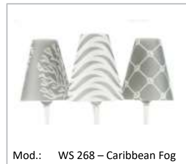
Mod.: WS 268 – Caribbean Fog