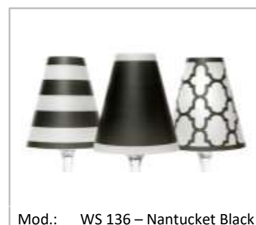
Mod.: WS 136 – Nantucket Black