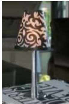
Mod.: BOT09-4 extra bright and dimmable