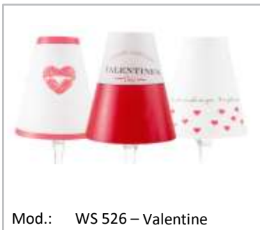
Mod.: WS 526 – Valentine