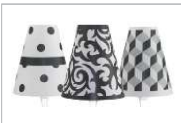
Mod.: WS-562 – standard shade set