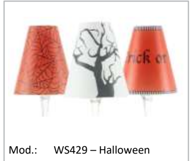
Mod.: WS429 – Halloween