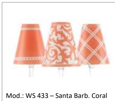
Mod.: WS 433 – Santa Barb. Coral