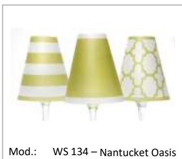
Mod.: WS 134 – Nantucket Oasis