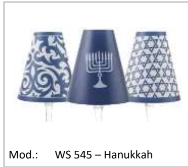
Mod.: WS 545 – Hanukkah